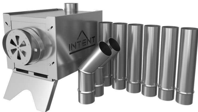
Long-burning camping stove «Intent Fisher»